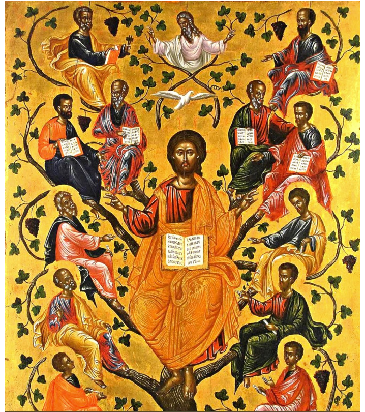
Christ the Vine by Victor of Crete (1674)